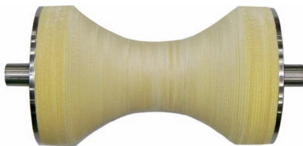
Concaved Fullback roller—one of many products in the Defender Series.

To address the challenge of handling round pipe extrusions, Albarrie developed a concave designed roller